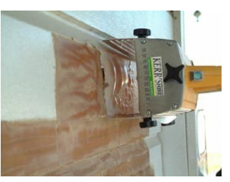
The Speedheater in action removing paint from weatherboards.

The Speedheater 1100 uses infrared heat to remove most kinds of paint and varnish. Infrared heat is a low tempera-